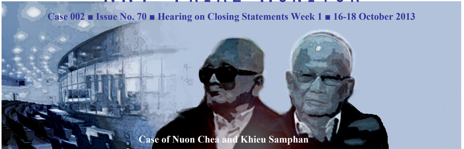
Case of Nuon Chea and Khieu Samphan

Case 002 ■ Issue No. 70 ■ Hearing on Closing Statements Week 1 ■ 16-18 October 2013